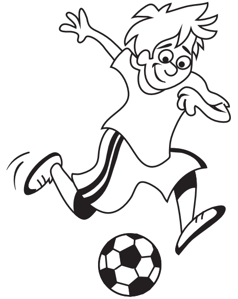
3 soccer player