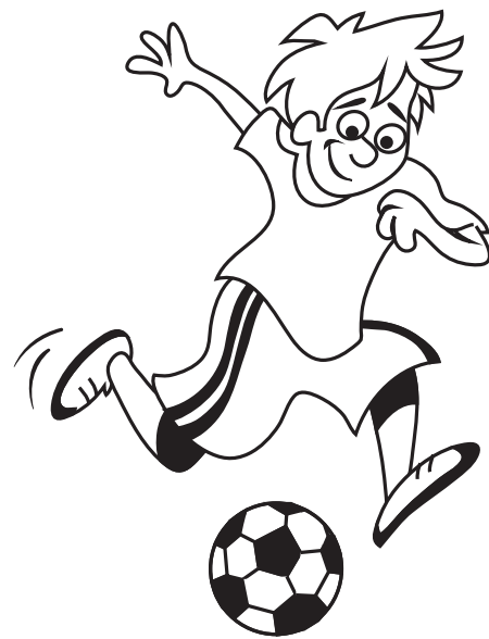
3 soccer player